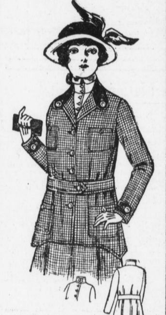
8757 Belted Coat for Misses and Small Women, 16 and 18 years.

Such a coat as this one is essentially youthful in its style. It is perfectly simple too, hanging in straight lines from the shoulders, with the fulness confined by means of the belt. In the illustration, there are four pockets and pockets are being much used just now, but either the upper or the lower pockets may be omitted if fewer are found more becoming, or, the coat can be finished quite plain without any pockets. On the figure, the lower edge is pointed and it can be made in that way or straight or it can be cut off to make a shorter coat. Also the collar can be made either high or low; altogether it is a most satisfactory coat for the early season. In the picture, it is made from one of the checked suitings that promise to be so much used, but the model will be found a good one for anything that is adapted to the tailored finish.