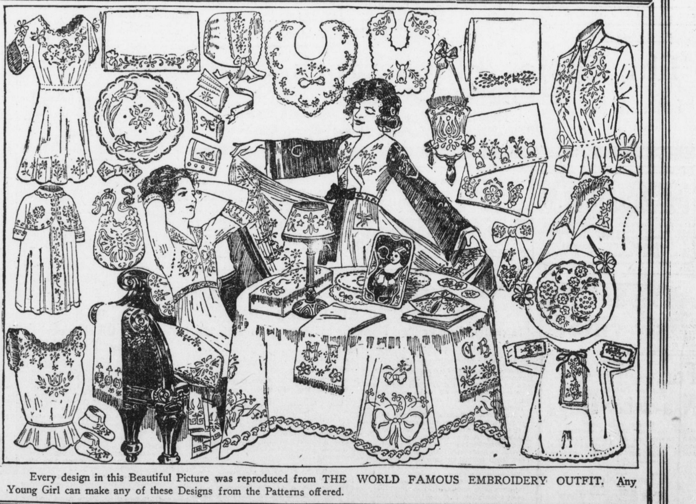
Every design in this Beautiful Picture was reproduced from THE WORLD FAMOUS EMBROIDERY OUTFIT. Any Young Girl can make any of these Designs from the Patterns offered.

Yes, Madame, you'll have to hurry. This offer must be withdrawn in a few days. ONLY 1 COUPON AND 68c. With Mail Orders 7c. for Postage. Lose no time. Days short and supply limited. Get your outfit at once. EACH DESIGN TRANSFERS SEVERAL TIMES CLIP COUPON TO-DAY