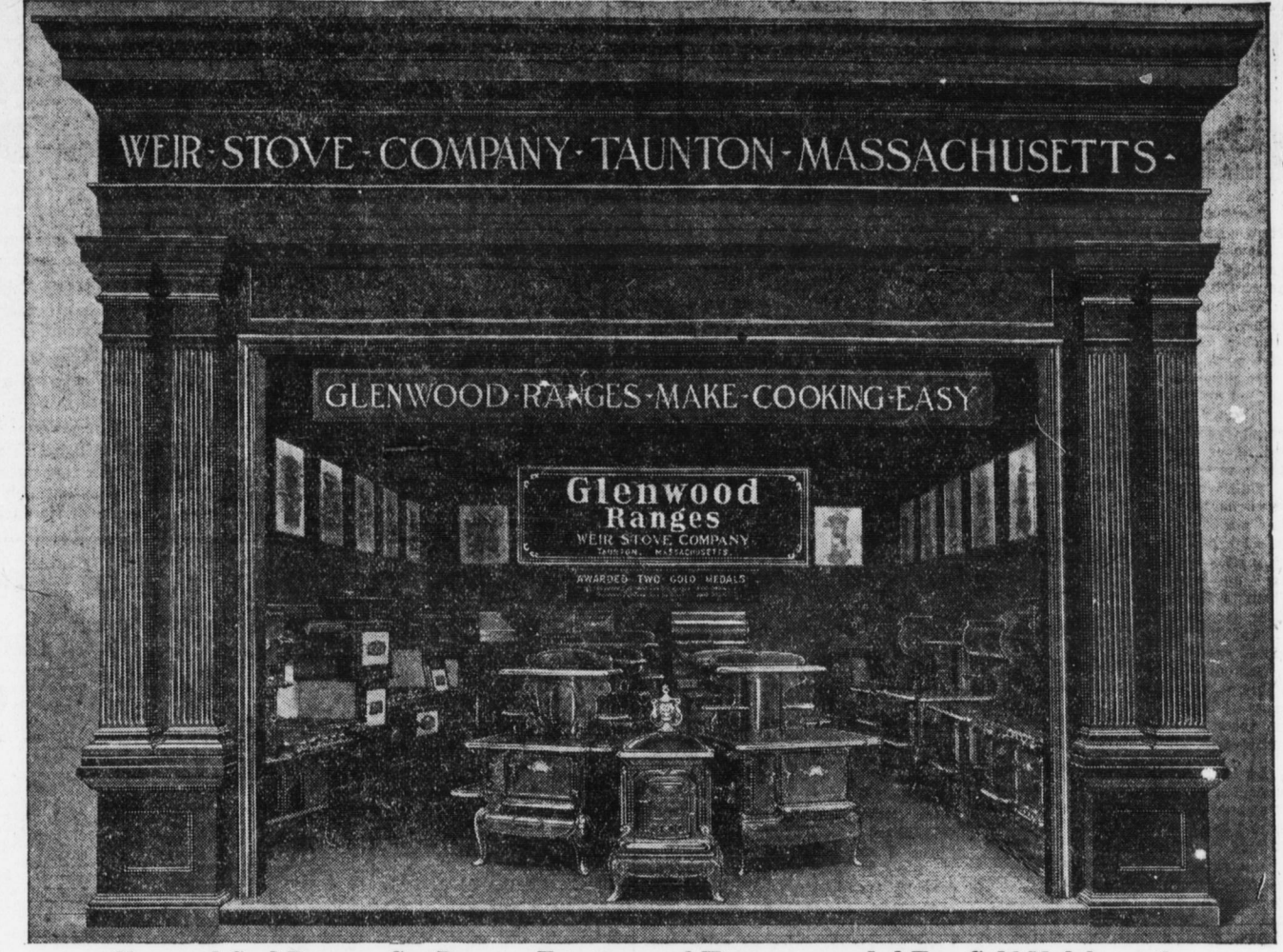
Glenwood Coal Ranges, Gas Ranges, Furnaces and Heaters, awarded Two Gold Medals, at the Panama-Pacific International Exposition, San Francisco, Cal., 1915.

Glenwood Ranges are the product of New England's largest and best known foundry. They are designed by makers of life-long experience. They weigh more, are put together better and burn less fuel than most ranges. The castings are life-long experience. They weigh more, better and burn less fuel than most ranges. wonderfully smooth and easy to keep clean.