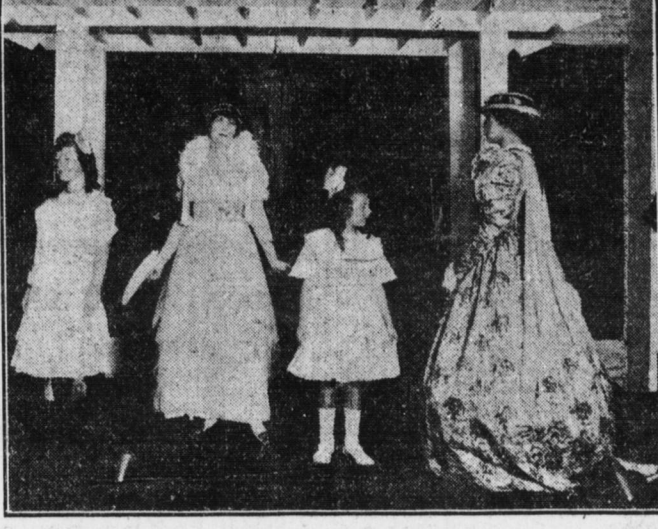
Comparison of the styles of 1871 with those of to-day was a pleasing feature of the Bowman & Co. Fall fashion show. The picture is a flash-light of one of the live model scenes on the stage erected for the show.