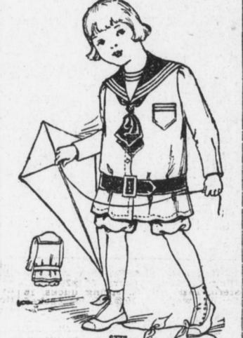
8777 Boy's Suit, 2 to 6 years.

No suit ever devised is more becoming to the small boy than this one in Russian style. It is finished with a sailor collar and with a low shield that means comfort as well as smartness. It can be made from washable materials and from wool fabrics. In the picture, white galatea is trimmed with collar of blue and that material is good one for the autumn, but the model can be copied in linen or in cotton poplin or in serge for the older boys. White cotton gabardine is good too and the collar could be either of white or of a color. Just now, there is a fancy for embroidering boys' suits and cotton gabardine or linen or galatea would be charming with the collar matching the suit and finished with scalloped edges, while the pockets and the shield also are scalloped. The suit is a very simple one to make, the coat being long and held in by means of the belt and the trousers are the regulation sort with hems at the lower edges in which elastic is inserted. The sleeves are laid in plaits at the wrists that give a pretty, cuff-like effect.