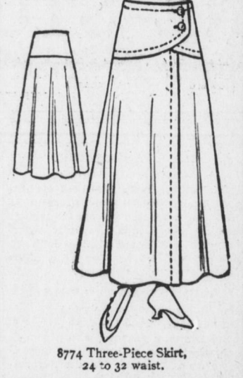
8774 Three-Piece Skirt, 24 to 32 waist.

The yoke skirt is to be much worn this autumn. This one is both exceedingly smart and exceedingly graceful. Women who are thinking about their autumn sewing will find the model a most satisfactory one for many uses. It can be cut either from wool material or from silk, it takes very becoming lines and the pattern with its new features means that making is a greatly simplified matter. You can cut along the outside of the pattern without allowing seams and you can mark the perfect basting line. There are only the side seams of the skirt to be sewed up. The front edges are turned under and hemmed. The yoke is quite separate and is finished at front and at lower edges and arranged over the skirt, then webbing is arranged under the upper edge of the skirt to hold it comfortably and firmly in place. As the skirt is in full length, it can be used without the yoke if the long lines are found more becoming or, if the yoke is used and less bulk is wanted, the material beneath can be cut away. In the picture, broadcloth is finished with simple, stitched edges. For the medium size will be needed 5 yds. of material 27 in. wide, 4 3/4 yds. 36 or 44; the width at the lower edge is 3 yds. and 7 in. The pattern No. 8774 is cut in sizes from 24 to 32 inches waist measure. It will be mailed to any address by the Fashion Department of this paper, on receipt of ten cents.