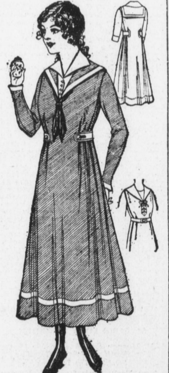
8742 One-Piece Dress for Misses and Small Women, 16 and 18 years.

Girls who are on the outlook for something really new for the late summer or for between seasons will find this dress exactly suited to their needs. It is made with bodice and skirt in one, it is drawn on over the head after the midday fashion and the belt is buttoned into place. It is exceedingly simple to make, takes the rewest and smartest lines and it is essentially youthful in effect. The skirt portion is shaped to provide the fashionable flare and there are tucks in the bodice that mean becoming fullness. The neck can be finished with a chemise and rolling collar or with a plain shield with low neck. In the picture, the dress is made of blue cotton gabardine with trimming of white, but the model will be found a good one for serge and for wool materials of the sort as well as for the washable ones, although linen, galatea and the like will be worn throughout the autumn. For the 16 year size will be required 6 1/2 yds. of material 27 in. wide, 5 1/2 yds. 36 1/2 yds. 44, with 3/4 yd. 27 for the shield 3/4 yd. for the bands and trimming. The pattern No. 8742 is cut in sizes for 16 and 18 years. It will be mailed to any address by the Fashion Department of this paper, on receipt of ten cents. Bowman's sell May Manton Patterns. Try Telegraph Want Ads