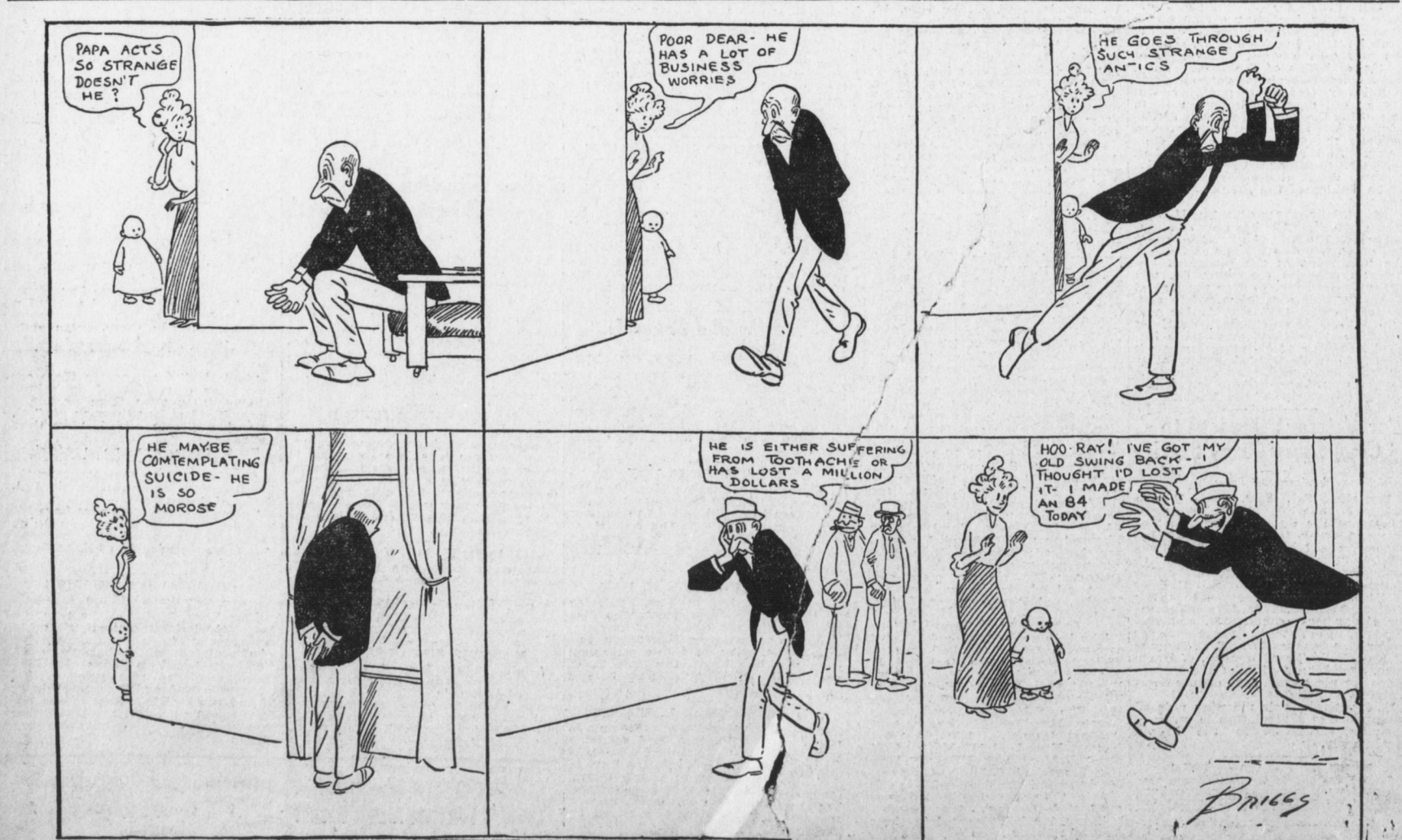
When You Lose Your Stroke---That Is Something to Worry About By BRIGGS