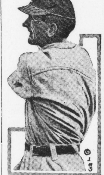
JOE JACKSON Joe Jackson, former Cleveland star, who was sold to Chicago White Sox is making good. He started to be a factor in winning games on his first appearance. There is some talk about the deal not being satisfactory, but it is not Jackson's fault.