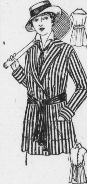
8730 Sports Coat, 34 to 44 bust.

FOR SUMMER SPORTS A New Coat That Can Be Worn With Open or With Closed Neck. By MAY MANTON