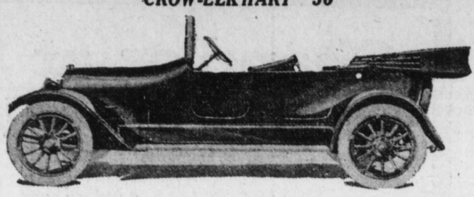
CROW-ELKHART "30" New to Harrisburg but not new to the motor industry is the Crow-Elkhart which is represented here by Monn Brothers at Seventeenth and Swatara. The "30" touring comes fully equipped at $1725. It is made by an old established vehicle concern of Elkhart, Indiana, who has specialized in motor cars for years and perfected a strong organization of practical automobile manufacturers.