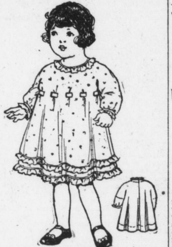
8728 Child's One-Piece Dress, 2 to 6 years.

For the very little folk, the simplest frocks are the smartest and here is one that can be given the Empire suggestion by the use of ribbon passed through big buttonholes or made plain as liked.