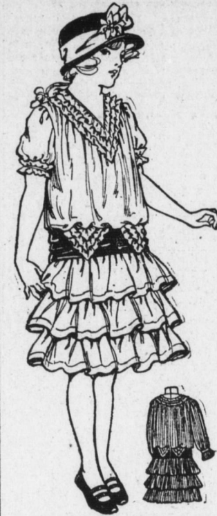
8722 Girl's Dress with Flounced Skirt, 10 to 14 years.

Here is one of the prettiest possible dresses for a little girl. It shows the waist line dropped just a little below the normal.