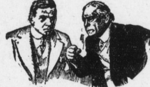
"Yes I Know Your Weakness, You Were Drunk and We are Ruined."

Dazed and stunned, and seemingly bending under a weight of suddenly