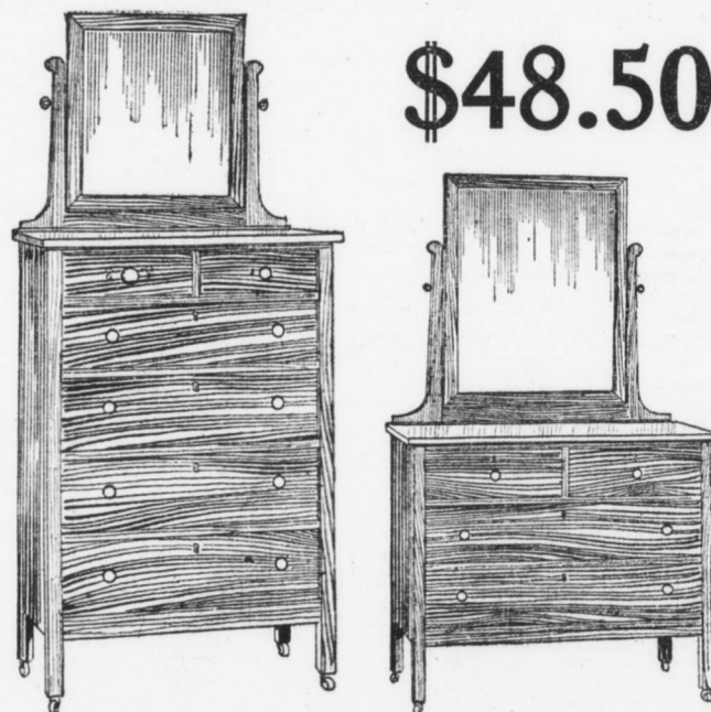
$48.50 REGULAR SELLING PRICE, $60.00. These pieces are of simple Colonial design, in the rich dull finish. Heavy French plate mirrors. The Dresser is 40 inches wide. Choice of wood or brass knobs.