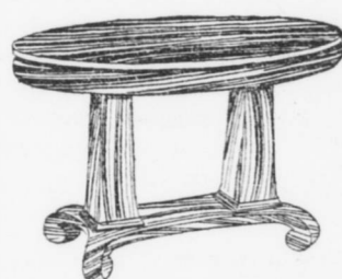
This Beautiful Library Table $22.50 Regular Selling Price, $29.00. Made of solid mahogany, 28"x45", oval top, one drawer; casters.