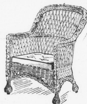
This Full Size Willow Chair $2.75 REGULAR SELLING PRICE, $5.00. A fine French willow chair, especially well built. Natural finish. Cushion not included. Not more than one to a customer.