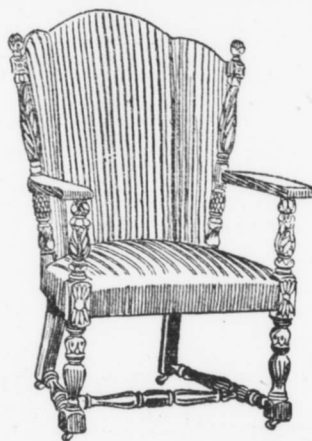
This Elegant Mahogany Chair $19.50 REGULAR SELLING PRICE, $30.00. Made of solid mahogany with denim covering. Hand carved. The well-known "Kensington" design.

Here Are a Few Samples of Our Furniture Bargains