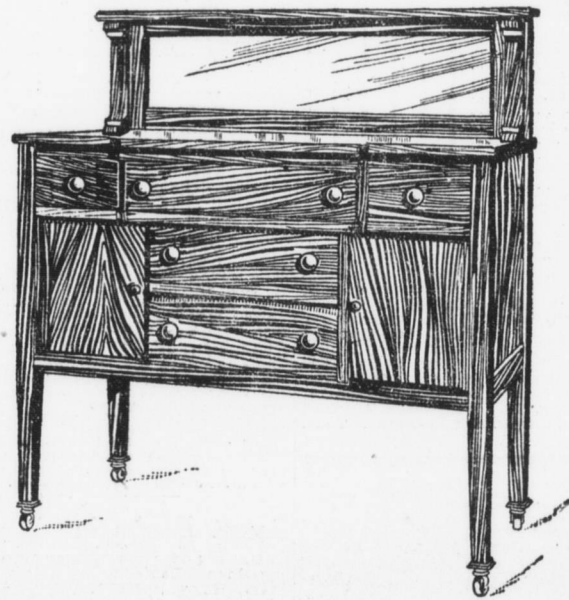
This Artistic Buffet, Solid Mahogany . . . $37.50 REGULAR SELLING PRICE, $50.00. Chippendale design. Has one large linen drawer at top, made to look like three small drawers. Lined silver compartment. 48 inches long with heavy French plate mirror. Chairs and table to match, if desired.