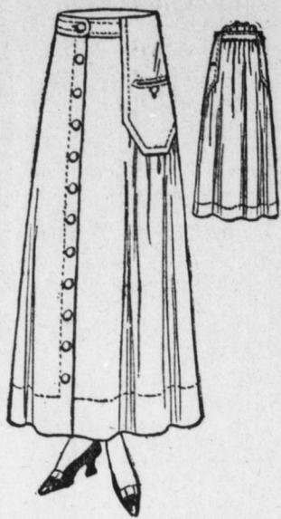
8625 Three-Piece Gathered Skirt, 24 to 32 waist. Bowman's sell May Manton Patterns.