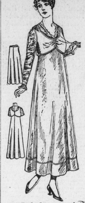
8636 Empire Gown, 34 to 42 bust.

It would be hard to find a more attractive gown than this one. It gives the Empire effect at its best, for while the skirt is wider than was that of the Empire period, it nevertheless is not exaggeratedly so and the lines are the prettiest most attractive, most graceful that could be.