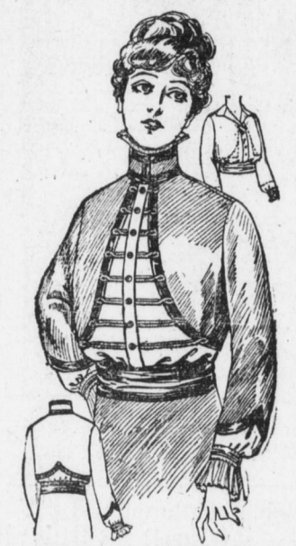
8630 Blouse with Bolero Effect, 34 to 42 bust.

For the medium size will be needed 2½ yds. of material 27 in. wide, 1½ yds. 36, 1½ yds. 44 for the bolero portion, with 1½ yds. 27, ½ yd. 36, yd. 44, for the blouse portion, 4½ yds. of velvet ribbon and 3 yds. of