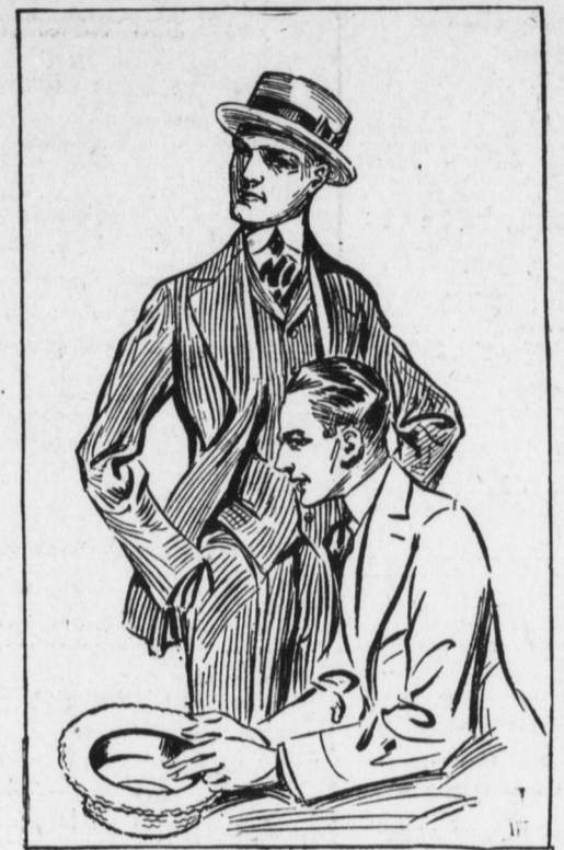
Starting Tomorrow, A