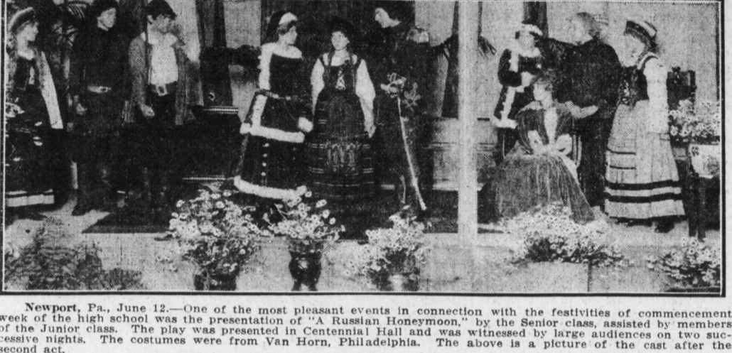
Newport, Pa., June 12.—One of the most pleasant events in connection with the festivities of commencement of the high school was the presentation of the play 'A Russian Honeymoon' by the Senior class.