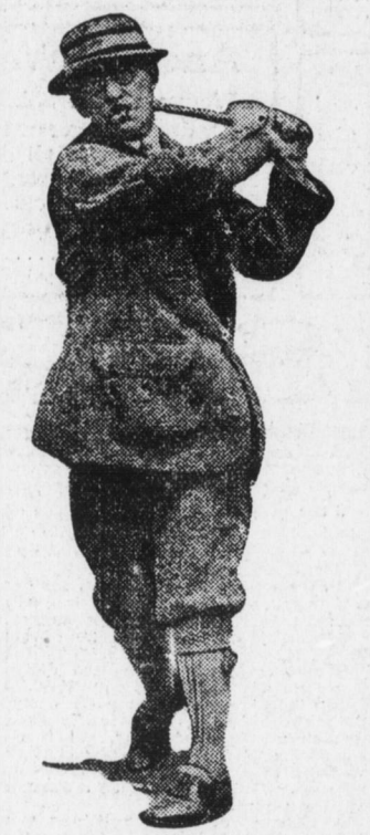
WALTER J. TRAVIS

Walter J. Travis, aged 53, showed a crowd of young golfers what he could do at his age when he won the metropolitan championship on Long Island against a field of men of national renown in the game.