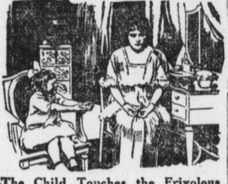
The Child Touches the Frivolous Woman's Heart.