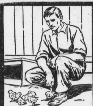
It Pays to KNOW

There are Dollars in Summer Eggs Prices are usually better than in the Spring and it pays to know how to get eggs at this time.