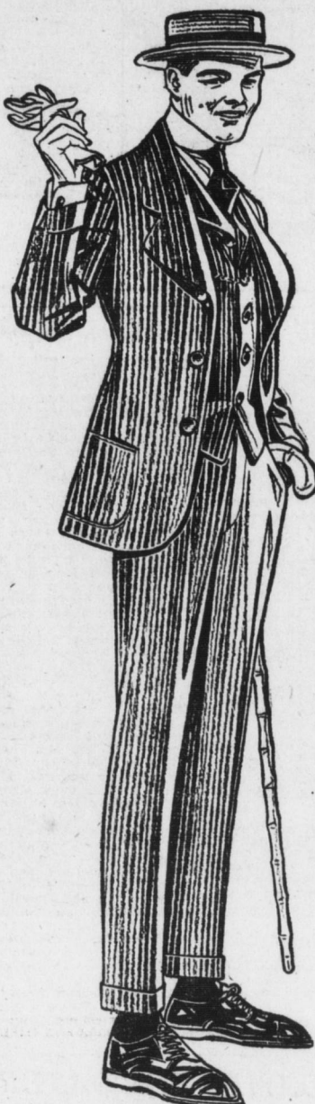
COPYRIGHT 1915 THE HOUSE OF KUPPENHEIMER

The sole aim and purpose of The House of Kuppenheimer is to produce better clothes than anyone else anywhere—always. How well they have succeeded in this—also how well we have succeeded in keeping prices down to the lowest level—is plainly shown in the remarkable stock of Kuppenheimer Suits, in every wanted pattern and favored model, which we are selling at the moderate prices of