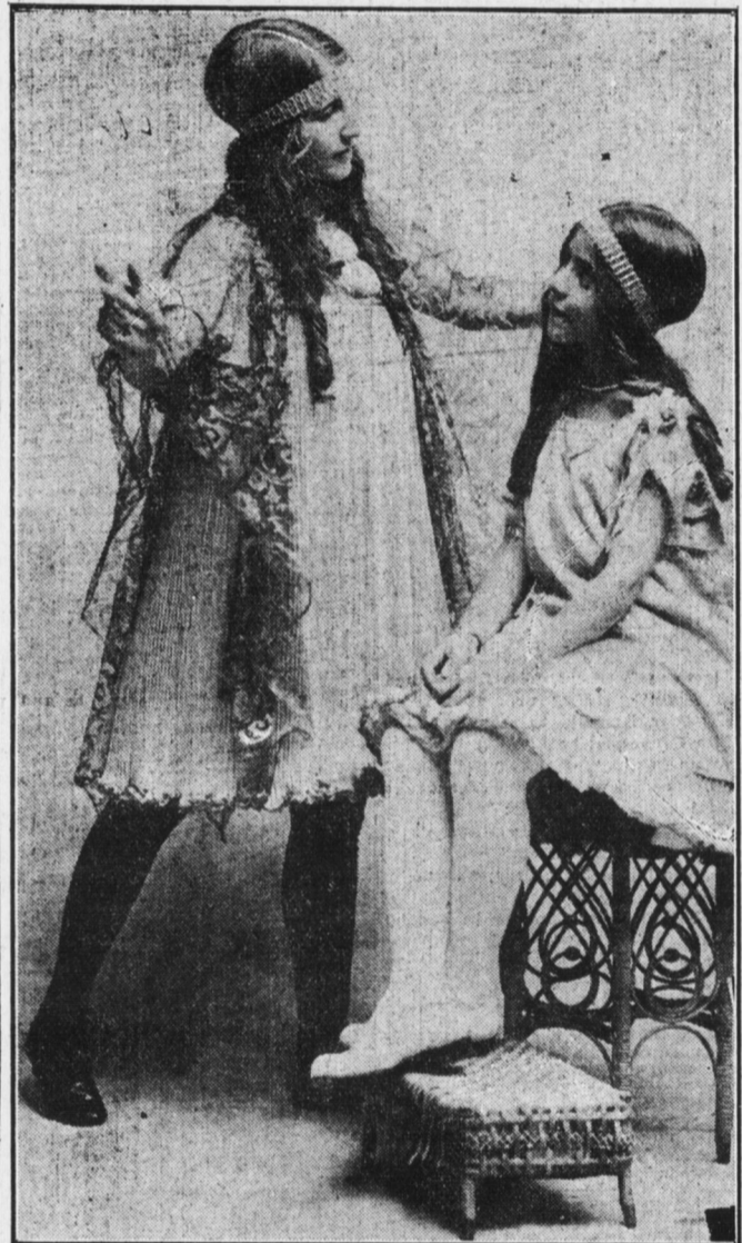
SANTA MARIA SISTERS.