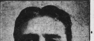
Famous actor returns to Harrisburg after absence of several years.