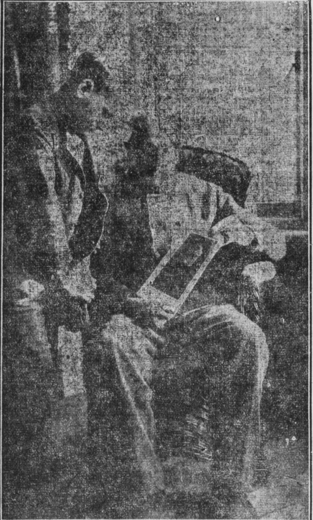
AN OLD BELGIAN SHOWING HIS GRANDSON A PICTURE OF KING ALBERT, WHOM THE PEOPLE OF BELGIUM DEARLY LOVE.