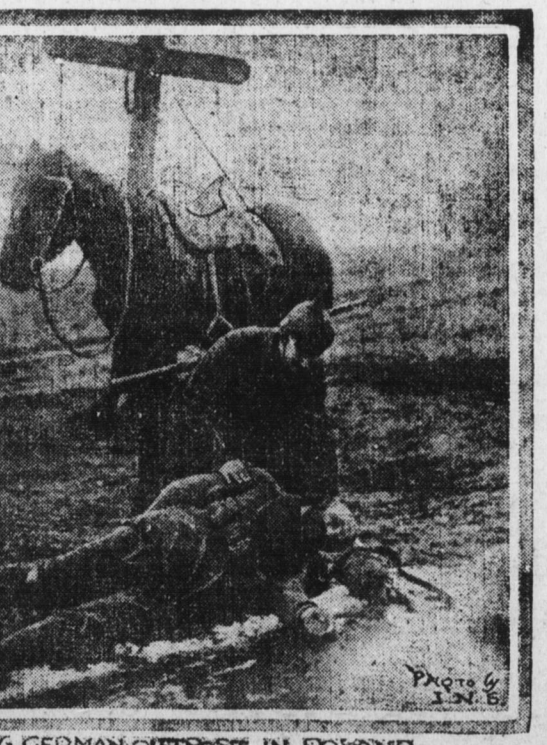
DYING GERMAN OUTPOST IN POLAND

The photograph shows an Uhlan who has come on a dying German outpost in Poland. The soldier has been wounded and has dragged himself to a roadside pool of water to slake the burning thirst that always accompanies a bullet hurt. He has crawled directly to the foot of a rude cross erected at the spot where two Russian soldiers are buried.