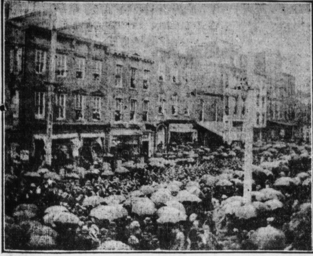
Scene in Market street, Harrisburg, April 28, 1898, when Company D marched to the Pennsylvania Railroad station to take the train for Mt. Gretna for Spanish-American war. The picture was taken in the morning a short time after the storm was at its height. The picture shows a portion of Market street between Third and Fourth streets.