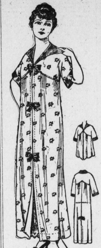
8502 Empire Negligee. Small 34 or 36, Medium 38 or 40, Large 42 or 44 bust.

Such a graceful, pretty negligee as this one will find a place no matter how many there may already be in the wardrobe. It can be cut in full length or in saccage length, and many women will want both, for each serves a different purpose and both are charming. Empire lines are always becoming, always pretty for negligees, and the way in which the gown is cut and planned means that it is extremely simple and easy to make.