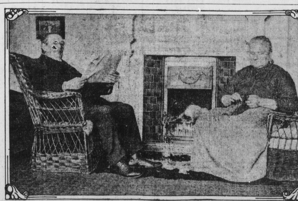
BELEM REFUGEES ENJOYING THE COMFORT OF AN ENGLISH FIRESIDE. THOUSANDS HAVE BEEN GIVEN SUCH HOMES AS THIS IN ENGLAND