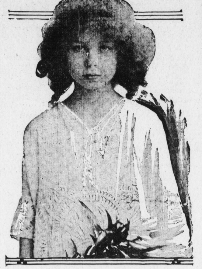
Little Princess Marie Jose, daughter of the King of Belgium, said to be the most beautiful princess in Europe, is now a wanderer on the face of the earth. The Germans have taken possession of her home, and she is in England with her friends. Her mother spends most of her time near the firing line with the king. This is the last photograph taken of the little girl.