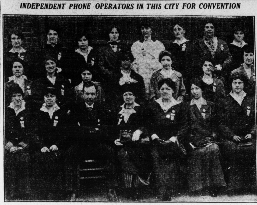
INDEPENDENT PHONE OPERATORS IN THIS CITY FOR CONVENTION. Above are seen a few of the chief operators who attended the joint convention of the Eastern and Western Independent Telephone Association in this city yesterday.