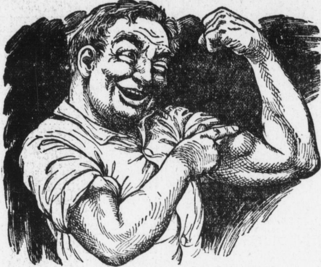
S. S. S. Gives You Backbone, Nerve Strength with Pure, Invigorated Blood.

Entire System is Clegged—Great Hordes of Germs Gongest the Blood to Cause Pimples, Boils, Carbuncles, Eczema and Other Skin Diseases.