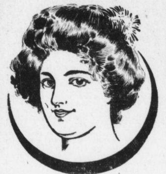
Beauty and Good Digestion Go Hand in Hand.

No More Gurgly Brash, "Lump of Lead," Bad Digestion, Heartburn or Stomach Troubles