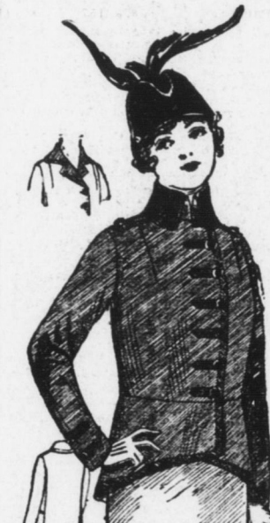
34 to 44 bust.

Closely at the Frent or Rolled Open to Form Lapels.