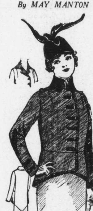
8505 Coat in Military Style,

For the medium size will be needed 3.74 yards of material 27 inches wide, 2.54 yards 36, 2.34 yards 44, or 2 yards 50, with 34 yard velvet and 5 yards of braid. The May Manton pattern 8505 is cut in sizes from 34 to 44 inches bust measure. It will be mailed to any address by the Fashion Department of this paper, on receipt of ten cents.