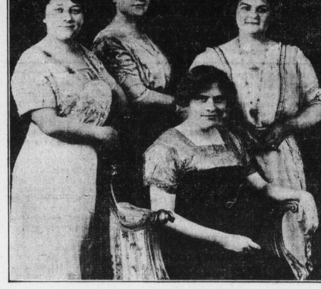
MEMBERS CECELIAN CONCERT COMPANY

Where Police Fail, Illumination Will Be Tried; New Locations