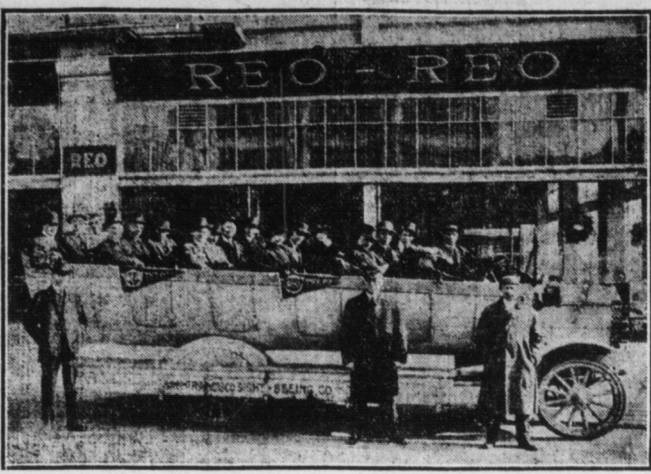
The banners on the car, shown on the picture, are a trifle misleading as this seventeen-passenger car isn't a stock model "Reo the Fifth," as one might infer. Neither is it built on a standard Reo Touring Car chassis.

The car shown is one of a flock of twenty-four owned by the San Francisco Sight Seeing Company, the concern which has the sight seeing privileges of the Panama Pacific Exposition. The bodies are especially made in San Francisco to meet specifications submitted by officials and are painted the official colors.