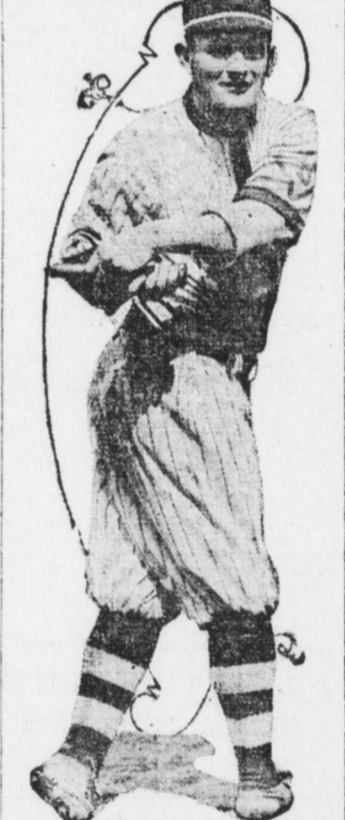
CHARLES "CASEY" STENDEL