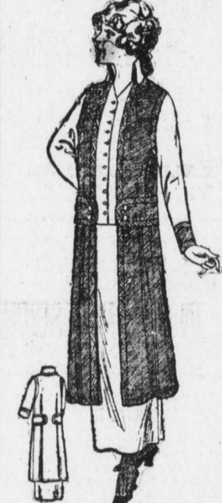
$519 Redingote Dress for Misses and Small Women, 16 and 18 years.

Truly the redingote idea has developed many variations. Here is one of the newest and the prettiest. It gives open fronts with a narrow vest that is designed for contrasting material, and finished with the military style. Made as it is here, with sleeves to match the vest and skirt, it is exceedingly smart but this season it primarily one of variety and the sleeves could match the redingote while the vest matched the skirt or the vest and collar could be of fancy material when plain material is used for the main portion of the frock, or both redingote and skirt could be of the same material.