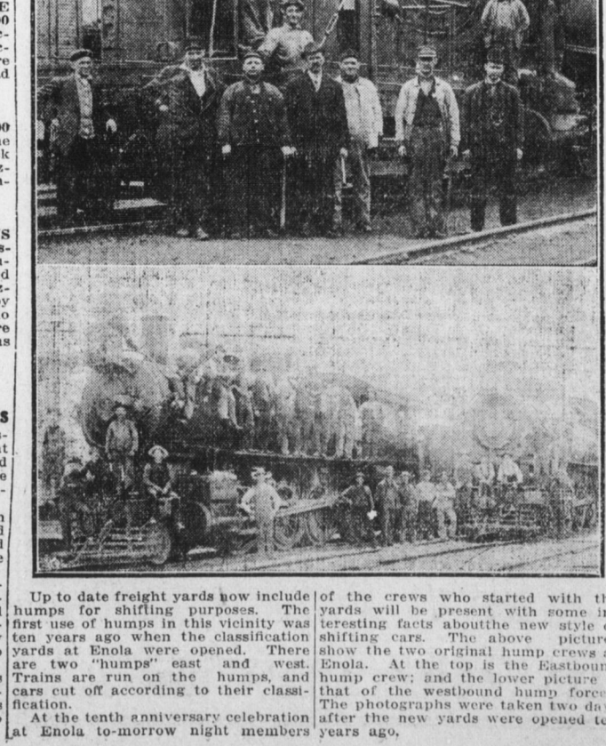
Up to date freight yards now include humps for shifting purposes. The first use of humps in this vicinity was ten years ago when the classification yards at Enola were opened. There are two "humps" east and west. Trains are run on the humps, and cars cut off according to their classification.