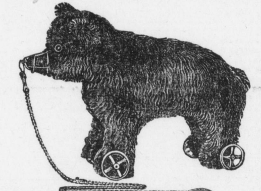
This is a Bear like you see in the big department stores in Philadelphia and New York for $2.75 and $3.00. Only a limited number for sale.

This is a handsome article made with 2-inch Mission frame 15x31 inches. 2 handsome pictures 9x12 inches each, and a French plate mirror 9x12 inches in center with 2 handsome bronze hangers in each end. Sold in many an art store for $4 and $5.