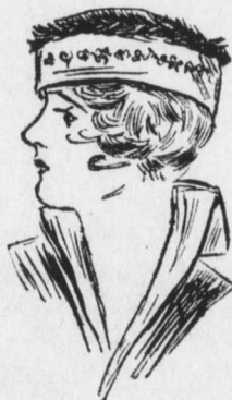
(Sketched by Miss Sara Page.)

SEE the display of La Reine Corsets on the 2nd Floor. A style for every figure. Guaranteed "Nobrake" side steel. Six models. Priced at $1.00 to $3.00.