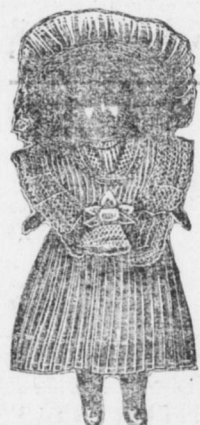
A completely dressed Doll—goes to sleep, attractively attired, and a good 75c value.