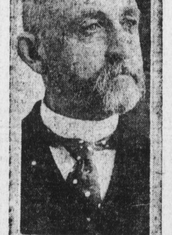
Admiral A. T. Mahan, who for many years has had an international reputation as a writer on naval subjects, died suddenly in Washington. His work as naval commander did not bring him much prominence, but his book "The Influence of Sea Power Upon History" made him known over the world. The admiral was born Sept. 27, 1840, at West Point, where his father was a professor and an expert on mathematical and engineering subjects. He was appointed to Annapolis from New York in 1856, and he graduated in time to serve through the Civil War.

His books on naval strategy, history, and his opinions on international politics made him influential throughout Europe, and his criticisms of the British naval policy were closely studied by the admiralty.