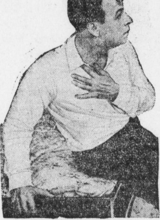
"I can't do it!"

At the moment that he received that stinging blow he heard a movement to one side of him, and, with the old instinctive fear of Thomas Gallon, he drew away back with his hand on the gun at his hip.