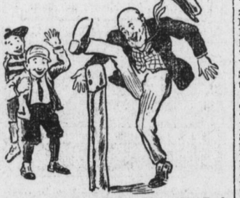
Kellogg's Sanitone Wafers Make Me Feel Like a Young Colt That Won't Stand Still Without Hitchin'.