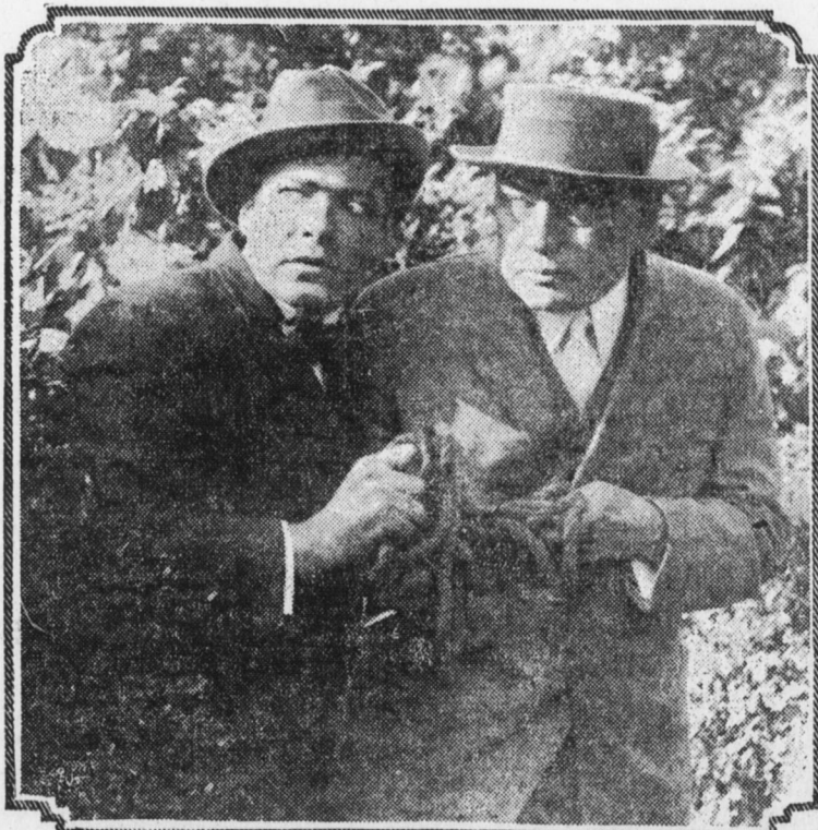
BRaine AND HIS ACCOMPlice PLAN THE CAPTURE OF HENRI SERVAN

Jones stared long and intently at his young partner. What did he really know? [TO BE CONTINUED.]