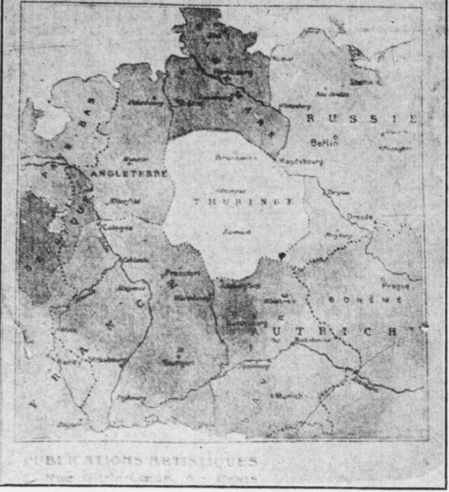
Herewith is a reproduction of a sketch found upon the body of a French soldier. It was sent by a friend in Europe to a resident of Harrisburg and it is supposed to represent the partition of German among the allies after the war is over.