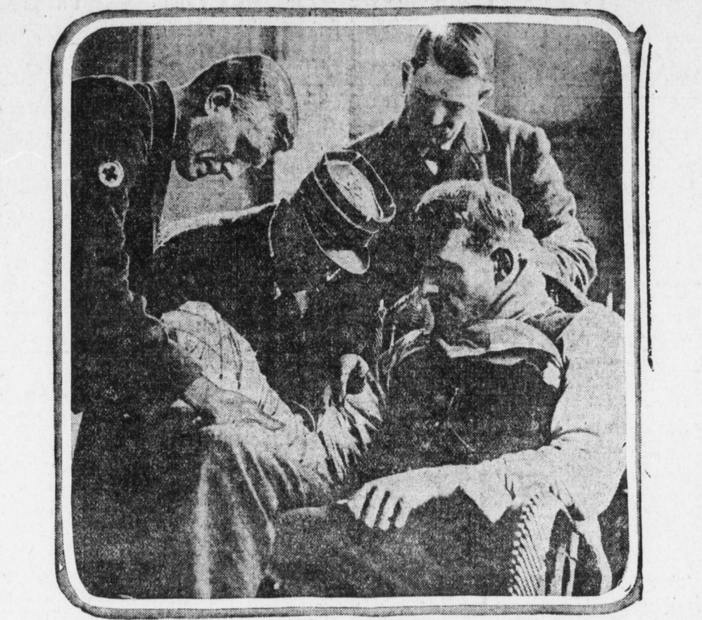
Binding the wound of an English aviator who was shot while soaring above the German line on the Yser.