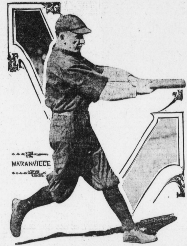
"Rabbit" Maranville, one of the fastest infielders in the National League, is expected to show some brilliant work during the world series. He will play shortstop for the Braves. He is said to be as good as Barry, Connie Mack's shortstop, in every way. He is as fast, and covers as much ground. Neither is much of a batter, and probably each holds his position because he is a fine fielder and knows the game.