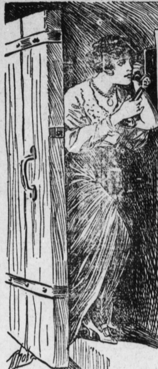
"I'm Going to Fight for the Browns—For My Home!"