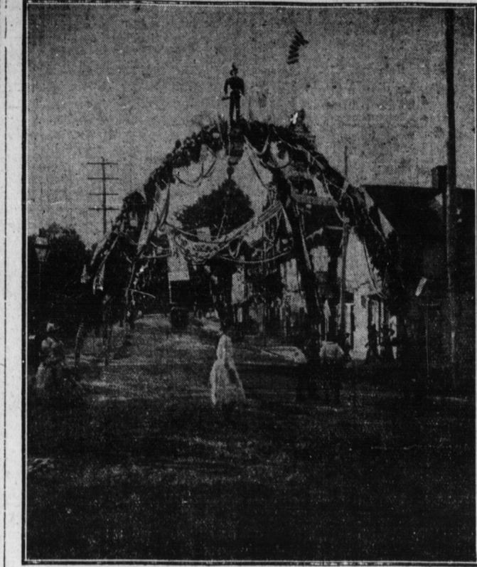
This photograph shows the hand some decorations at the Citizen League, Fourth and Walnut streets, at the time of the Dauphin county centennial celebration and the meeting of the Pennsylvania State Firemen's Association in September, 1885.