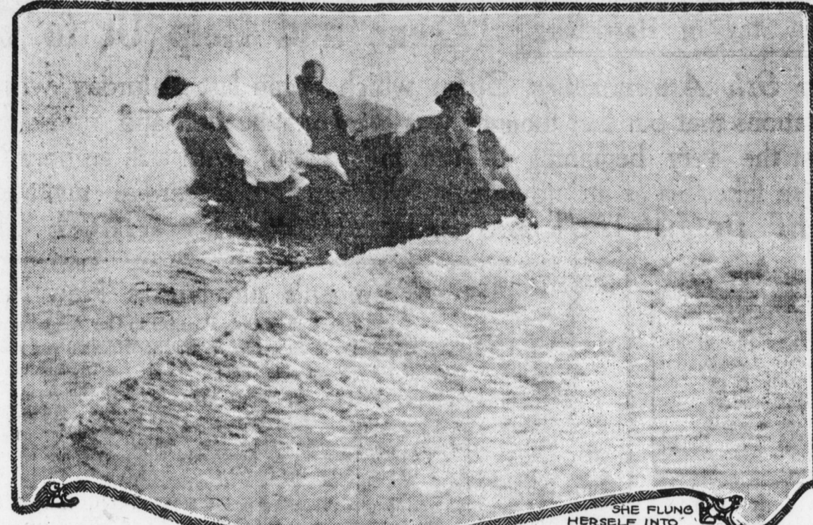
SHE FLUNG HERSELF INTO THE WATER.

"Yes, and it's the first time I ever heard you use it over the telephone. Jones, you were talking to my father!"